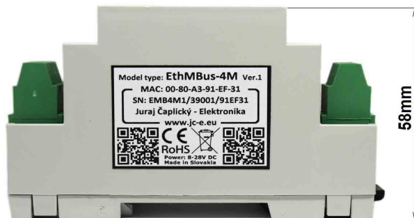
Side view with DIN rail attached