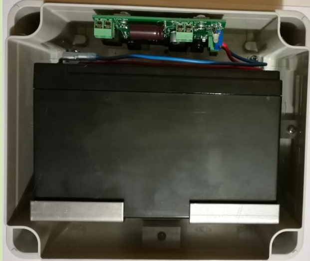
SolarUPS V3 SLA