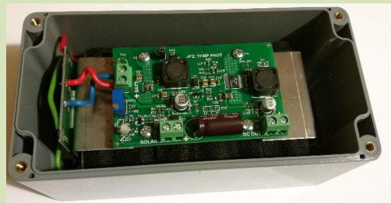
SolarUPS V3 Li

The device can serve constant uninterruptible power supply (UPS) in low or medium consumption equipment where mains power supply could not be or is difficult to be solved. Power may come from a 20W (or 30W) solar panel, but it is also possible to charge from the AC adapter. The device stores the energy in a 9000mAh SLA Gel (SLA version) or a 9000mAh Li-ion (Li version) battery pack. The battery type can be chosen according to your needs. Charging of the battery pack is performed intelligently with a Maximum Power Point Tracking function, using the power fed from the solar panel very efficiently.