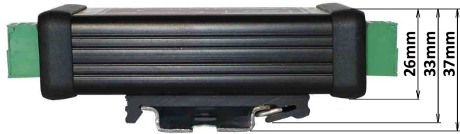
Side view with DIN rail attached